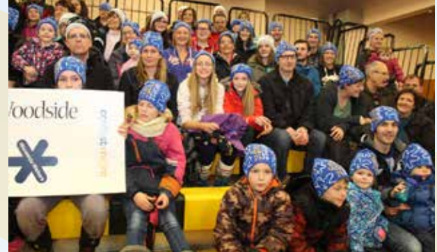
78 walkers on the top team from Woodside Bible Fellowship in Elmira raised $20,412.

The girls also raised more money than expected. "Originally we wanted to raise $1500—about $100 each. We ended up raising about $3500." News coverage in The Elmira Independent before the event helped them capture some anonymous donations. Many adults told Abigael that the team was an inspiration. "Participating in the event helped me see how impactful we can be as a team of youth. I saw how awesome it is to come together for the community."